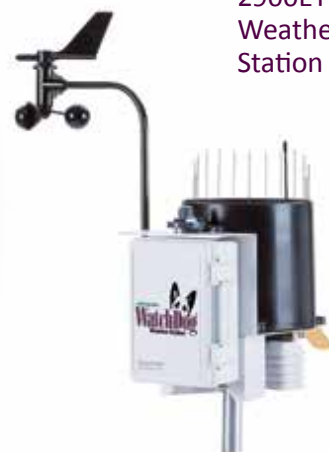
2900ET Weather Station

Measure DLI (Daily Light Interval), light duration and intensity for consistently better plant quality across greenhouse and high-tunnel structures. For outdoor growing monitor soil moisture, temperature and EC for efficient irrigation practices.