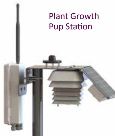
Plant Growth Pup Station