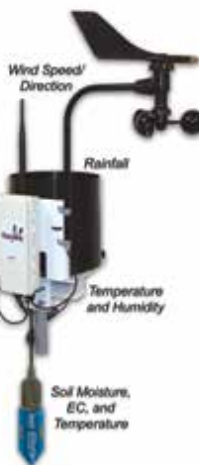
Pup Weather Station with Soil Moisture