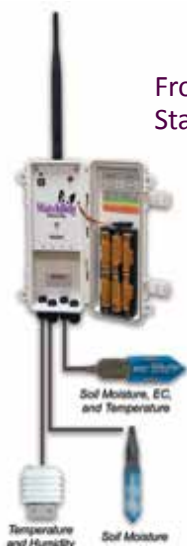
Frost & Irrigation Station

Easily detect frost and be alerted of conditions in your crops, monitor and note site-specific conditions for insect and disease pressures and monitor soil moisture remotely.