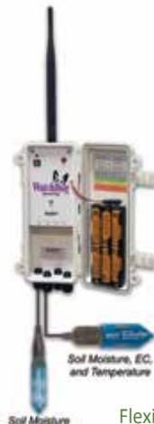
Irrigation Pup Station

Flexibly monitor both soil moisture and EC in a variety of soil textures for better irrigation decisions.