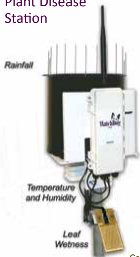
Plant Disease Station

Capture site-specific conditions remotely for insect and disease pressures, soil moisture monitoring, weather conditions, light and more.