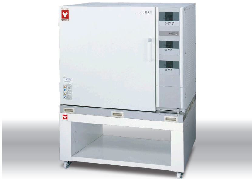
216L DIR631 (Stand : standard)