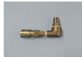
Water supply L shape socket (OWE 18)