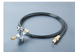
Water supply unit (OWH10)