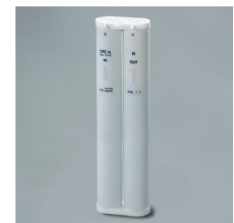
Ion-exchange resin cartridge CPC-N