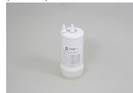
Pre-treatment cartridge (PWF-1)