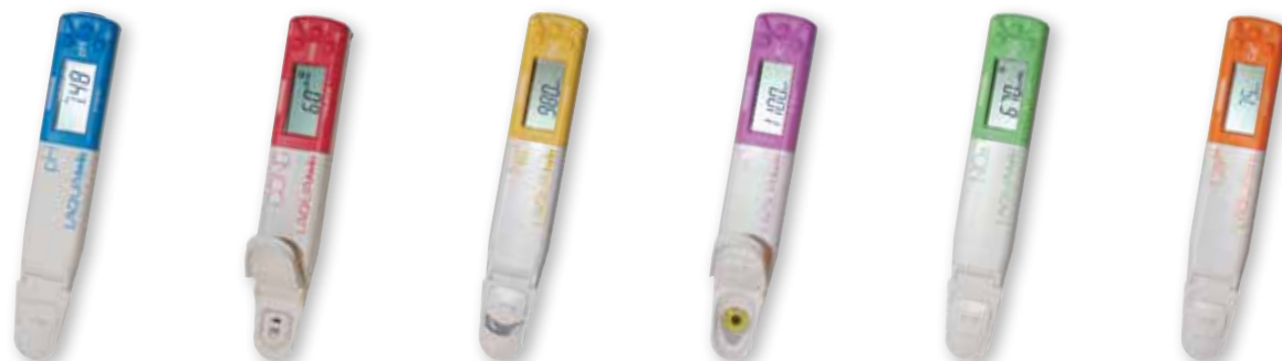
pH Conductivity (EC) Sodium Potassium Nitrate Calcium