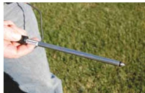
Exclusive Paired Sensor