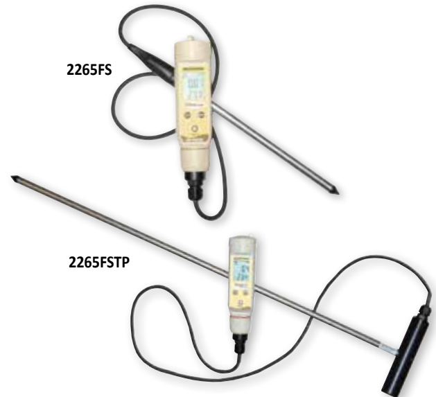
FieldScout Direct Soil EC Meter with 24 in (60 cm) T-Handle