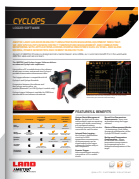
CYCLOPS LOGGER SOFTWARE

SEE OUR OTHER RELATED LITERATURE FOR THE CYCLOPS L: