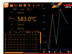
The Table View showing Instantaneous, Valley, Average and Peak, plus the unique Meltmaster temperature (on the 055L model) readings.

The Trend View displays Peak, Instantaneous, Average and Valley temperatures, Logger settings, Route Manager, Background Correction plus Timed Logging (taking measurements at pre-defined intervals between 1 and 60 secs).